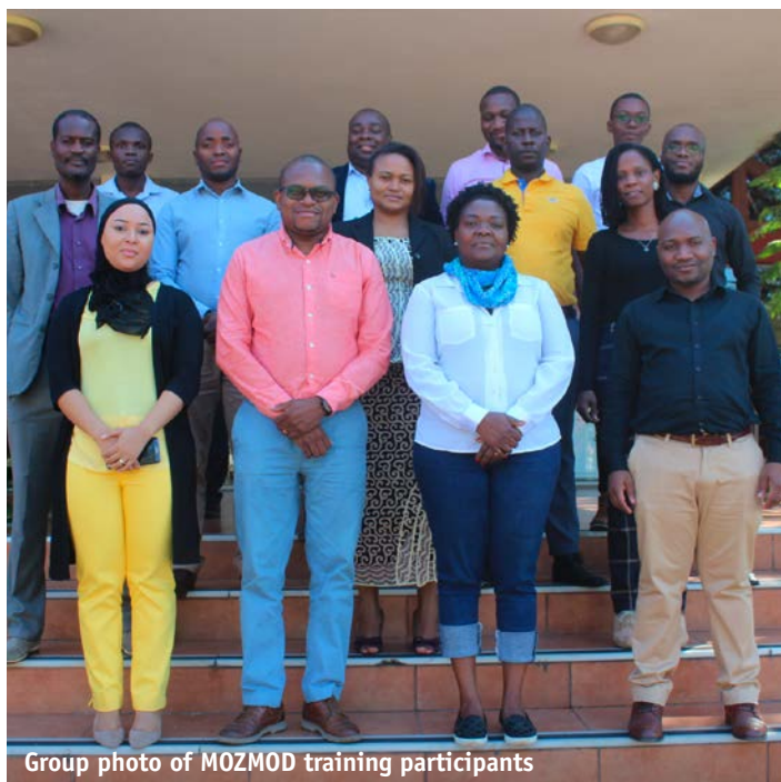
Group photo of MOZMOD training participants