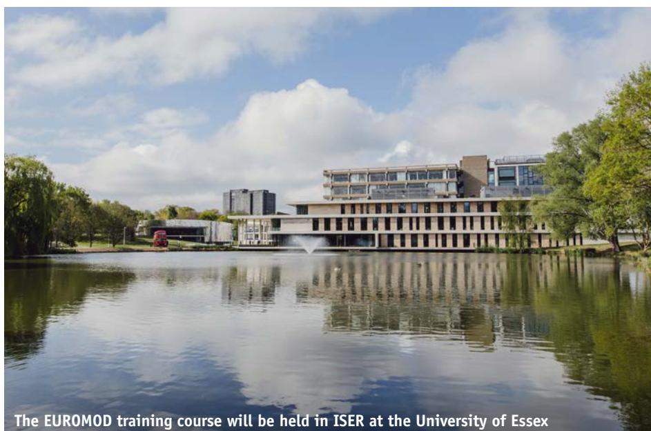
The EUROMOD training course will be held in ISER at the University of Essex

We have just had our Annual Conference, which was a great success and an opportunity for me to meet the larger EUROMOD community. Looking ahead, I would point to the forthcoming special issue on SOUTHMOD in the International Journal of Microsimulation, and the next Annual Congress of the International Microsimulation Association, which will take place in June in Galway, Ireland. There will be a large EUROMOD delegation there and we will present a wide range of applications and new ideas. Stay tuned!