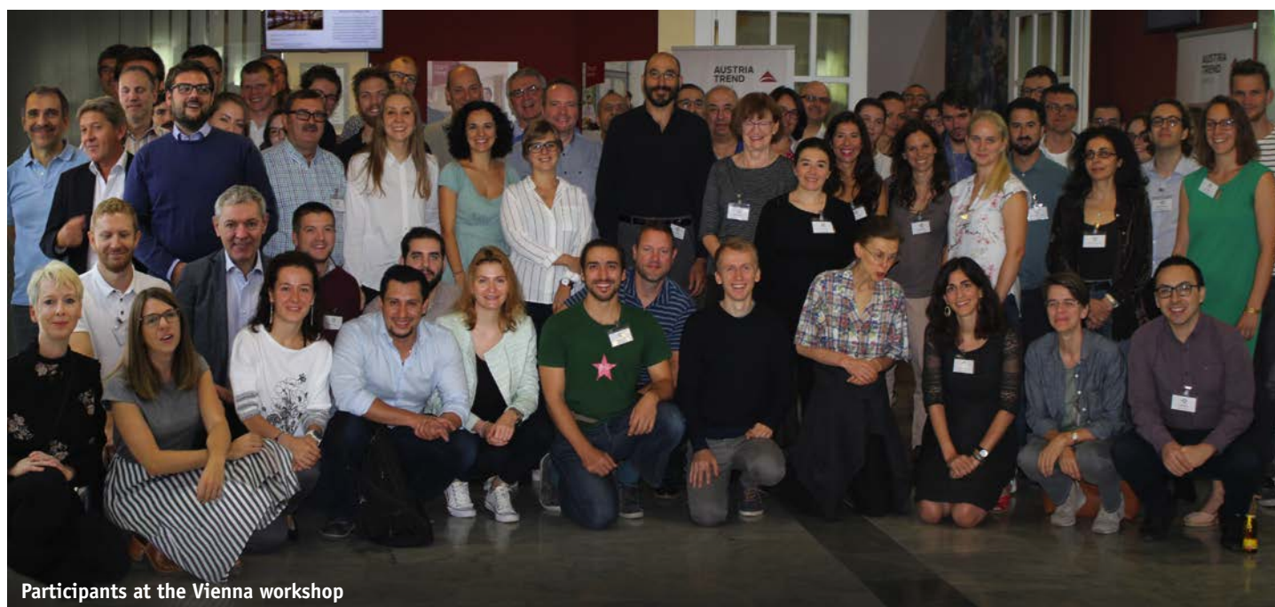
Participants at the Vienna workshop

comparable reference budgets, while taking into account publicly-provided or subsidized services, (2) simulating the cash benefits that households with children receive through the tax-benefit system, by making use of the new Hypothetical Household Tool (HHoT) in EUROMOD, and, (3) combining both types of information in order to compare the essential out-of-pocket costs of children between 6 and 18 years old with the simulated cash benefit packages. The paper focuses on six European welfare states: Belgium, Finland, Greece, Hungary, Italy and Spain. We propose a new indicator that can be used to assess welfare state generosity to families with children: the child cost compensation indicator. By making use of this indicator, we show that, even though with important cross-national variation, the out-of-pocket cost of children is generally compensated to a small extent through cash policies. Although support for families is higher at the lower end of the income distribution, for households living on a low gross wage, the income of a family with children is less adequate compared to a similar childless family, and is in many cases insufficient to participate adequately in society.