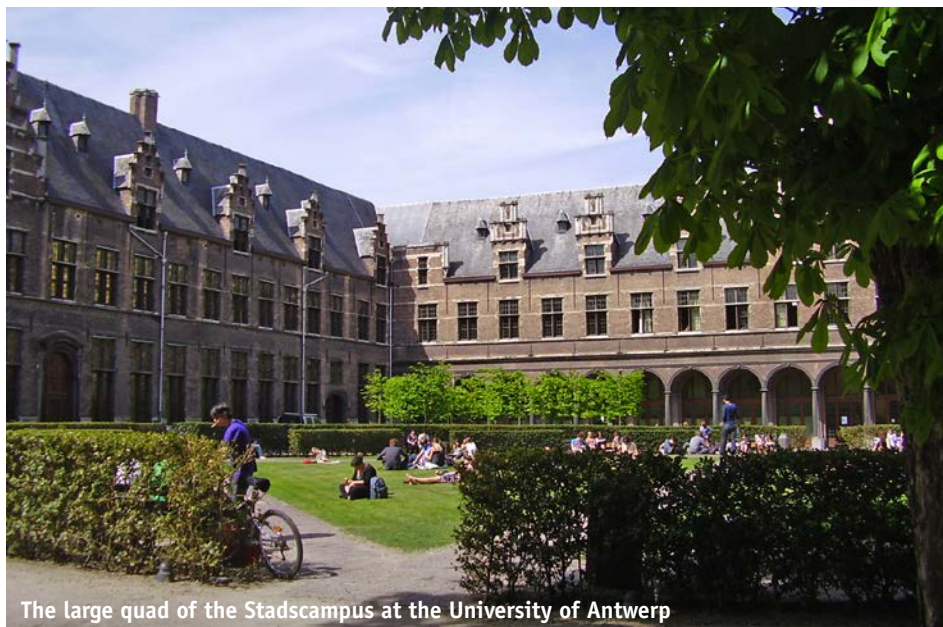
The large quad of the Stadscampus at the University of Antwerp

You may have noticed that we've launched a new blog series on the EUROMOD website, containing write-ups of research using EUROMOD, infrastructure projects and think pieces. We've got more content planned but we would be delighted to receive offers to contribute. If you have an idea, let us know via euromod@essex.ac.uk .