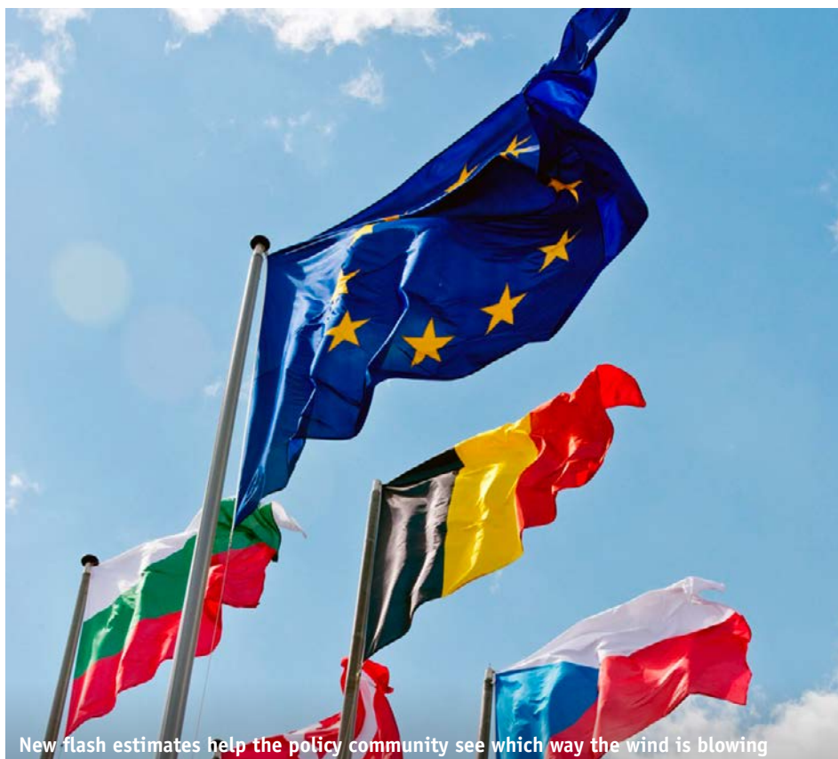
New flash estimates help the policy community see which way the wind is blowing